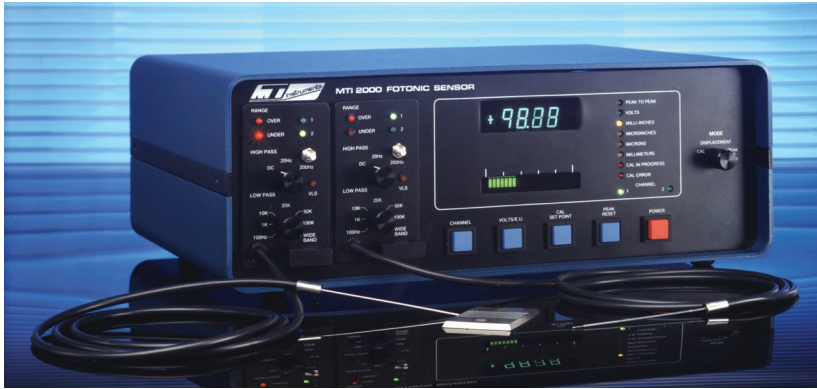
Figure 2. MTI-2100 Fotonic Sensor

The specific probe module selected to use with the MTI-2100 was the MTI-2125H with a wide measurement range of 4.5-mm. (0.175") at a standoff distance of 7.6-mm, (0.300").